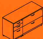
CCP3L2 132 S 1320x500x733