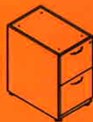
PDH6-1212 S 416x650x715