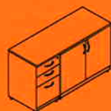
CCP3D2 132 S 1320x500x733