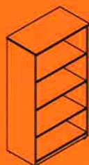
COF 1609 S (Open Front) 900x500x1692