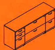
CCP3L2P2 173 S 1736x500x733