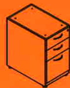
PDH6-6612 S 416x650x715