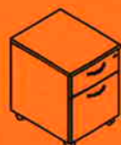
PM 612 S 416x500x580