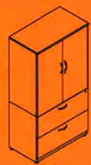
CL202 1609 S 900x500x1692