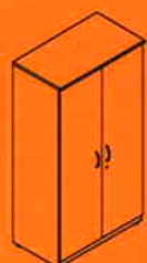
CD2 1609 S 900x500x1692

storage lateral file credenza flipper pedestal